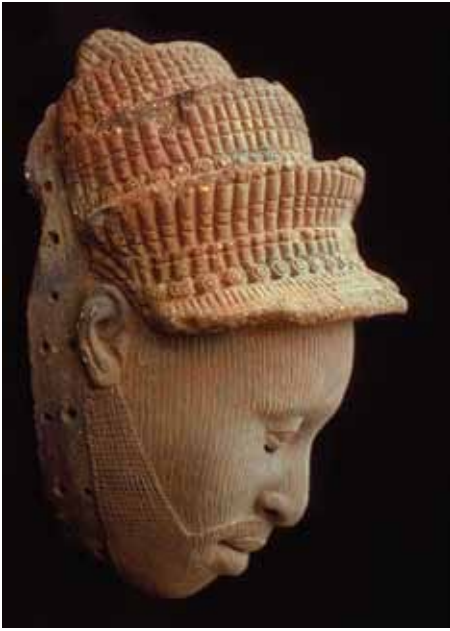
17 Mask with vertical line facial markings Obalufon temple site (Obalara's Compound), Ile-Ife, Nigeria, c. early 14th century CE Terracotta. Height: 32 cm Obafemi-Awolowo University. Exc. no. OC2.