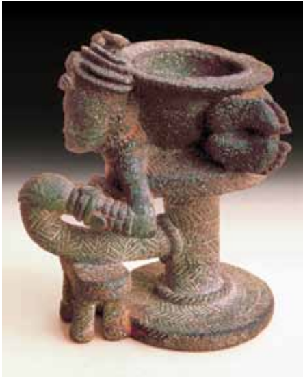
5 Bowl depicting a recumbent scepter-holding queen atop a looping handle throne Ita Yemoo Site, Ile-Ife, Nigeria, c. early 14th century CE Copper alloy; Height: 121 mm Nigeria National Museums, Lagos. no. L.92.58.