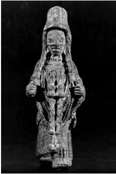
12 Figure of Ife king Found in Benin palace, c. early 14th century CE Copper alloy. Height: 124 mm Nigeria. National Museums, Benin. Museum reg. no. 17.