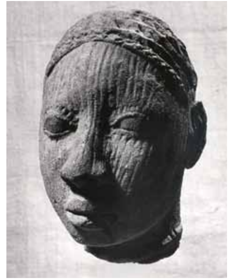
16 Head with vertical line facial marks Osangangan Obamakin Shrine, Ile-Ife, Nigeria, c. early 14th century CE Terracotta; Height: 14 cm Said to represent Osangangan Obamakin. Mus. reg. no. 30. Renumbered 49.1.18.

A striking terracotta vessel (Fig. 22) buried at the center of an elaborate potsherd pavement at Obalara's Land, an Ife site long affiliated with the Obalufon family, also offers clues important to early display contexts of these heads. This vessel incorporates the depiction of a shrine featuring a naturalistic head with vertical line striations flanked by two cone-shaped motifs described by Garlake (1974:145) as crowns. The scene seems to portray an Obalufon altar with different types of crowns and an array of Obalufon and Ogboni ritual symbols that find use in coronations, among these edan Ogboni, consistent with the use of the Ife life-size heads in chiefly and royal enthronements overseen by the center's Obalufon priesthood.