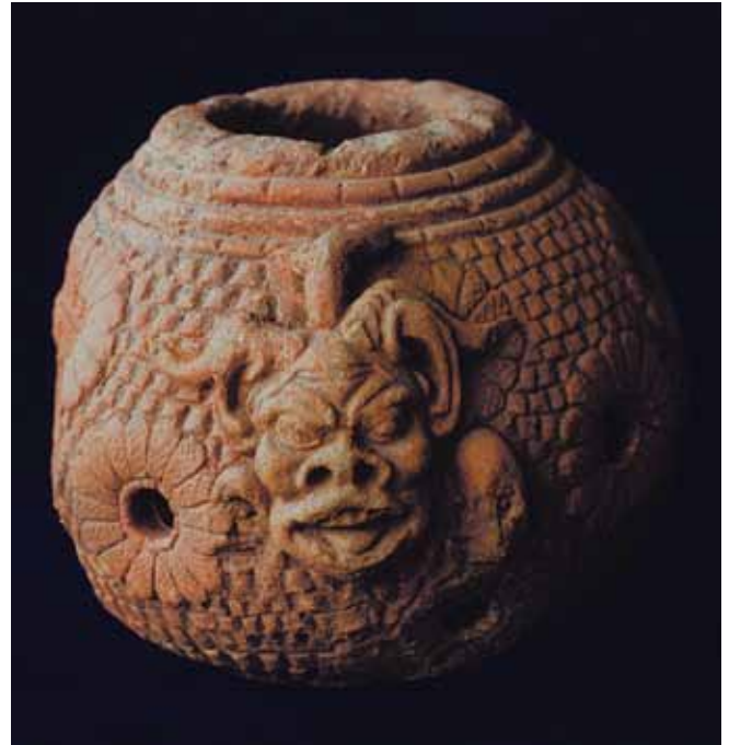
13 Vessel with monstrous face and sixteen rosette patterns around the surface, some with mica centers Aroye compound, Ile-Ife, Nigeria, c. early 14th centu- ry CE Terracotta; Height: 178 mm Unregistered when photo- graphed