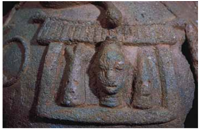
22 On vessel from Obalara's Land, Ile-Ife, Nigeria Terracotta Detail of shrine showing head with vertical line facial marks, flanked by two conical forms

There also appears to be a reference to Ife on a 1375 Spanish trade map known as the Catalan Atlas. This can be seen in the name Rey de Organa, i.e. King of Organa (Obayemi 1980:92), associated with a locale in the central Saharan region. While the geography is problematic, as was often the case in maps from this era, the name Organa resonates with the title of early Ife rulers, i.e. Ogane (Oghene, Ogene; Akinjogbin n.d.). The same title is found in a late fifteenth-century account by the Portuguese seafarer Joao Afonso de Aveiro (in Ryder 1969:31), documenting Benin traditions about an inland kingdom that played a role