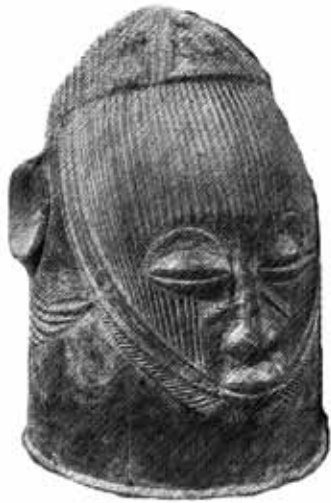
15 Mask with vertical line marks Igala, 19th–20th century Wood; Height: 35 cm Nigeria National Museums, Kaduna. After Eyo 1977:194 DRAWING: SUZANNE PRESTON BLIER