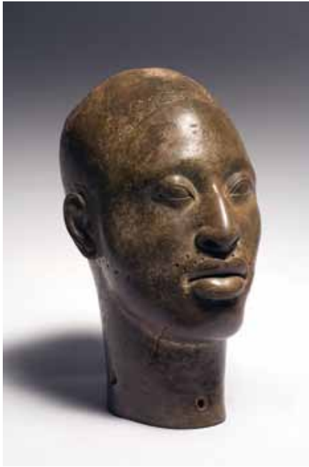
19 Life-size head without facial markings, beard line holes Wunmonije Site, Ile-Ife, Nigeria, c. early 14th century CE Copper alloy; Height: 29 cm National Museums, Ife. Museum registration, no. 9. Renumbered 38.1.9.