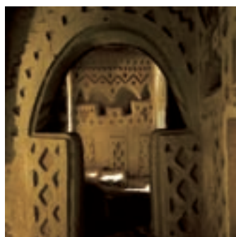
WHILE AUSTERE ON THE EXTERIOR, THE HAUSA MOSQUE AT KOSSA, NIGER, ABOVE, HAS A VIBRANT DOMED INTERIOR. CARVED DETAILS WITHIN THE HOUSE OF SIDI KA IN AGADEZ, NIGER, LEFT, ILLUSTRATE THE MANNER IN WHICH WEST AFRICAN ADOBE ARCHITECTURE TAKES ON THE QUALITY OF SCULPTURE.