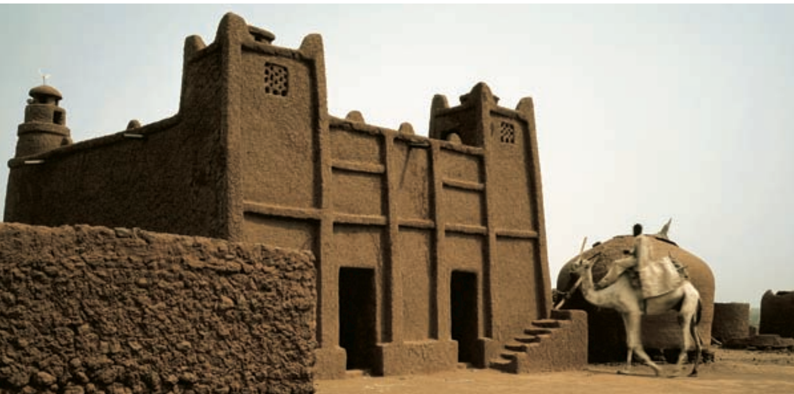
IMAGES FROM BUTABU ADOBE ARCHITECTURE OF WEST AFRICA BY JAMES MORRIS, PRINCETON ARCHITECTURAL PRESS, 2003.